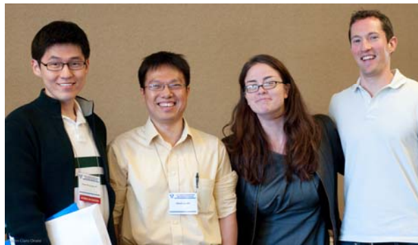
Residents from Bakersfield